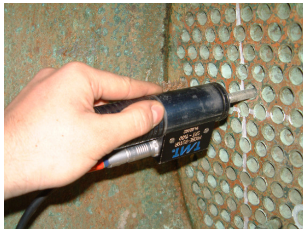
Diagram 2: Handheld Rotoscan for the inspection of tubes